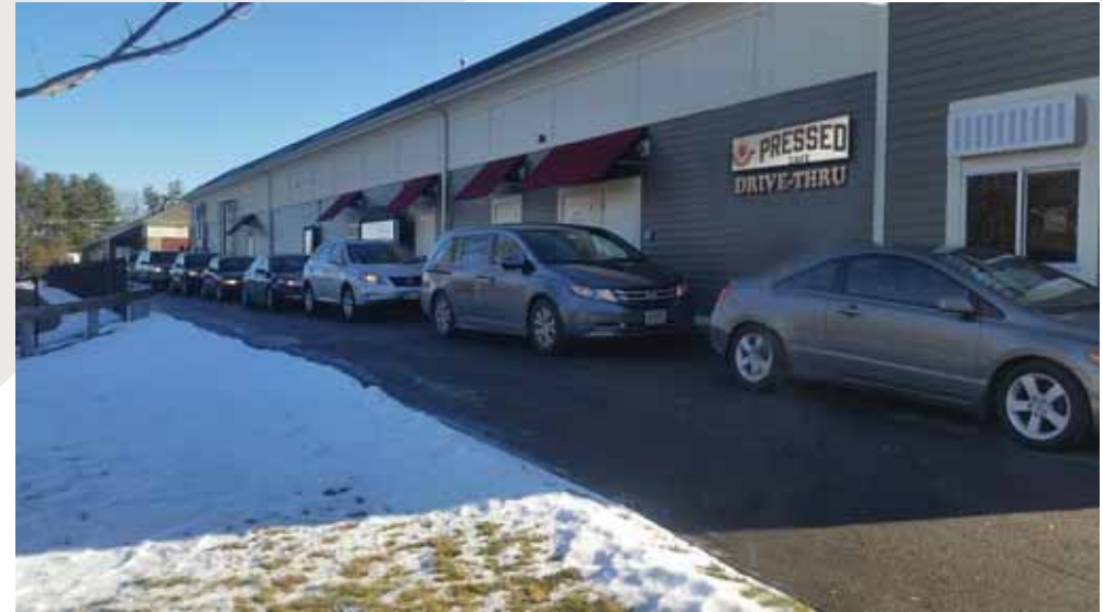
Actual photo taken at lunch time, Pressed Café - Tara Commons